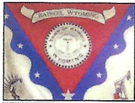
Lowell Clawson Mayor

Town of Batroil 1101 Antelope Drive PO Box 58 Batroil, WY 82322 307-324-7653 www.TownOfBatroil.com